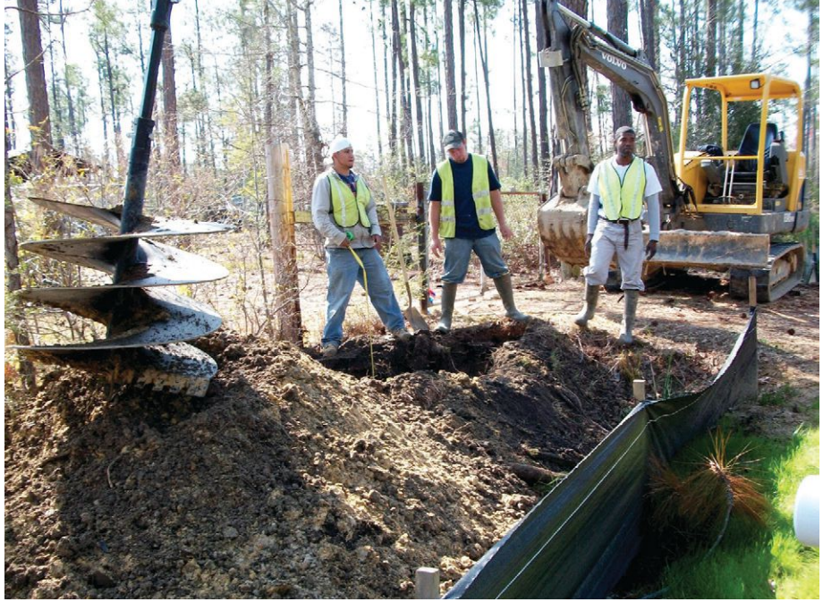
Use of a power auger is an efficient, clean, low impact method for installing E/One grinder pump tanks in the ground—site conditions permitting.

out of FEMA trailers. While many across the affected region continue to fight to this day for compensation from their private insurance companies, every U.S. taxpayer would play a role in its recovery effort.