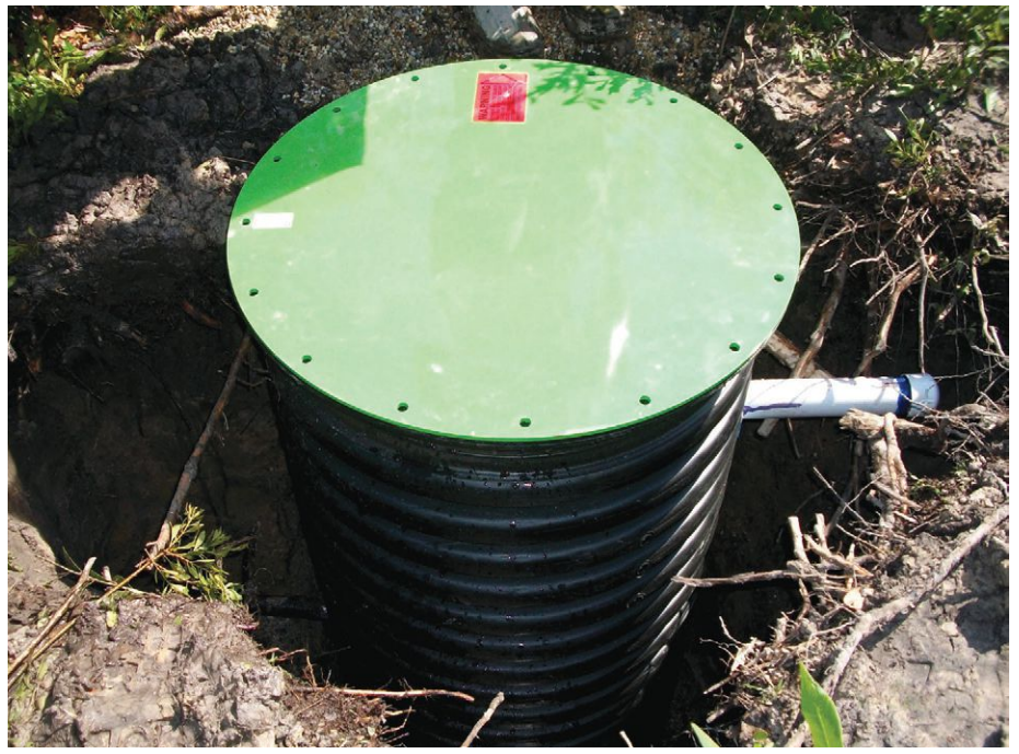
A high flood grinder pump station, rated for up to 15 feet of flood over cover, protects the integrity of the grinder pump system in flood prone areas

The master plan for Hancock County identified projects to be constructed over roughly a five-to-ten-year time frame.