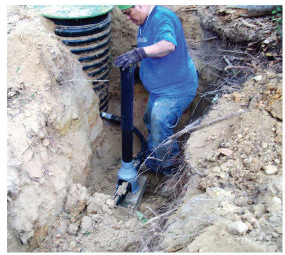
Grinder pump station installation.

"The broad area to be sewered only had to have four major pump stations (consisting of a buried precast concrete wet well, with either two or three variable speed, submersible pumps and controls) with everything in between directly connected to the E/ One pumps and a small diameter force main system. The project's design which needed a pump system with the ability to meet extreme and changing heads conditions—fell within E/One's wheelhouse."