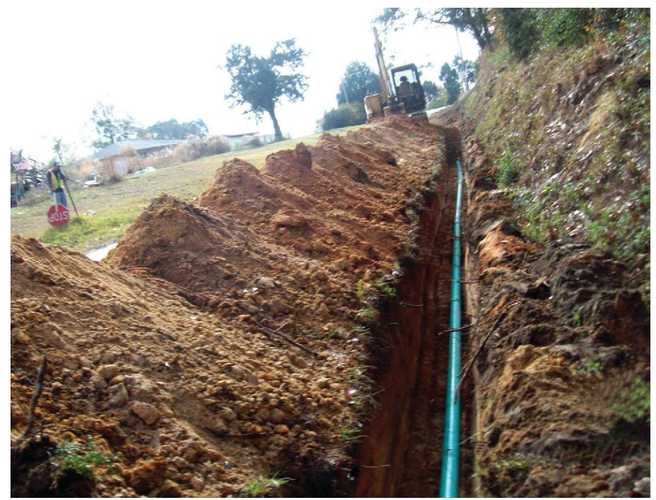
Pressure sewers use small-diameter pipelines, minimizing environmental disruption.

Clemens, who was Compton's project engineer for the new system, says, "The biggest challenge with Kiln was the relatively sparse population distribution within a broad geographic area. The area to be serviced was over 25-square-miles with only