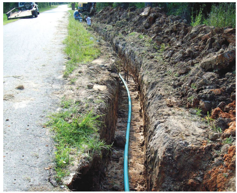
Small diameter flexible pipe being installed alongside roadway with minimum environmental disruption.

through how the implementation of E/One's All-Terrain Sewer™ (ATS) low pressure system offers a simple, effective, and inexpensive solution for not only the Kiln but also comprises the largest installed base of pressure sewers in the world, serving more than one million end-users daily. ◆