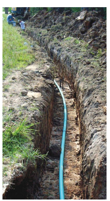
Small pressure sewer mains require only small trenches during installation.

Environment One Corporation emerged the winner of a public bid process. In 1971, the Niskayuna, N.Y.-