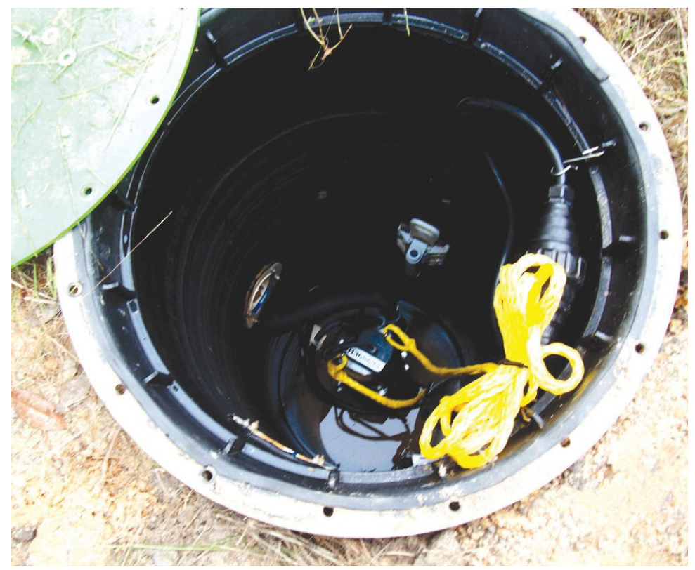
Top view of E/One grinder pump station.

"In the end, the low-pressure won out on cost feasibility over the gravity system and the vacuum system had too many geographic and topographic issues to overcome," says